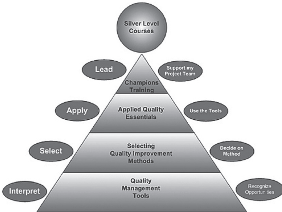
Figure 2. Silver Quality Fellows courses